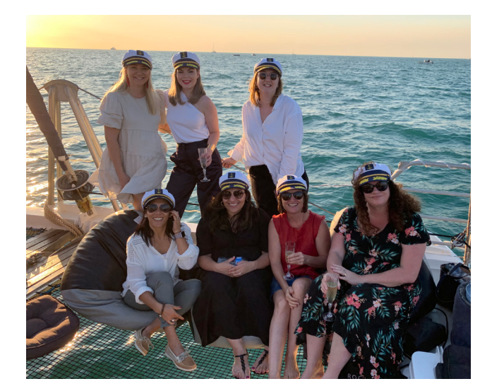
Celebrating the SWELL pool party

Getting nautical at the True North boat cruise